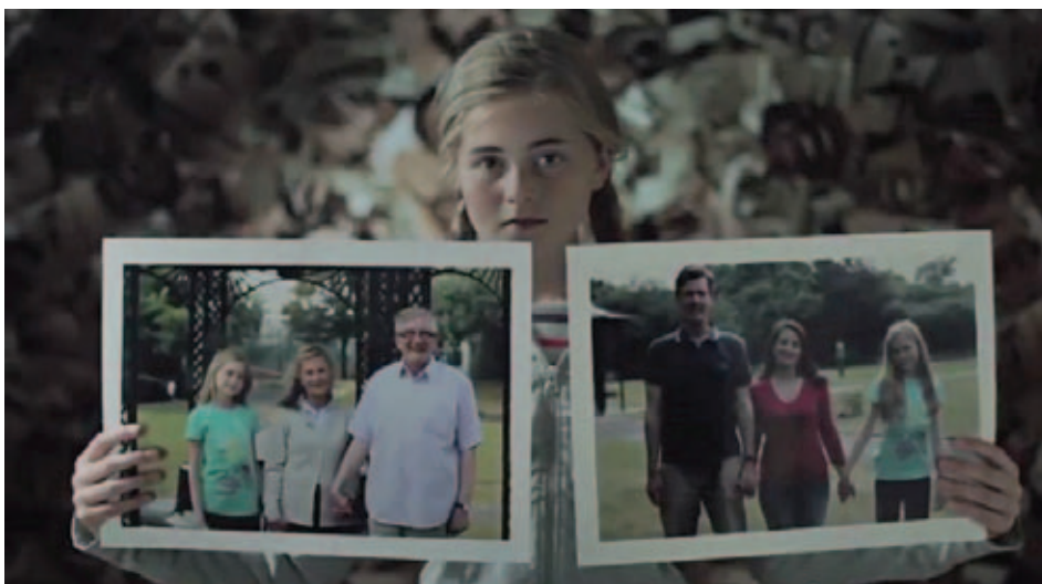
Who would you choose for me? The video lets viewers decide between grandparents and adoption.

The Government has announced plans for a substantial cut to welfare support for disabled children – see page four. The Children's Society has organised a petition against these changes. Visit http://epetitions.direct.gov.uk/petitions/915 for details.